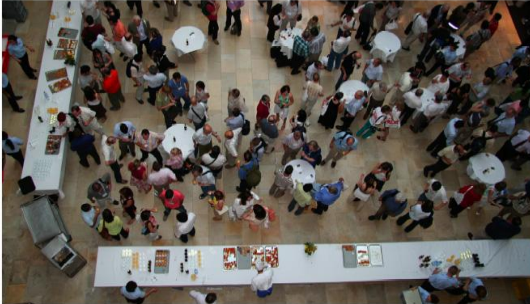
Participants of ICIAM during the refreshment break